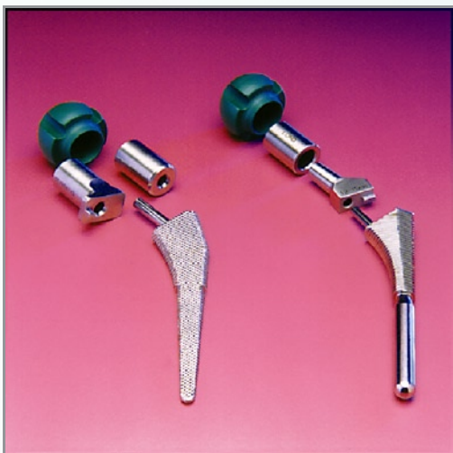
Figure 2 Trial Reduction on Broach

Trial reduction, to determine fit and range of motion, can be performed with either the broach ( Figure 2 ) or femoral implant ( Figure 3 ) in place. On the Provident System, one bushing assembles on the femoral stem, and a separate bushing assembles on the broach. For all other hip stem systems, the trial bushing assembles onto the trial neck or the femoral stem. The bushings match the three unipolar neck lengths (X-short, Short or Special Order Long).