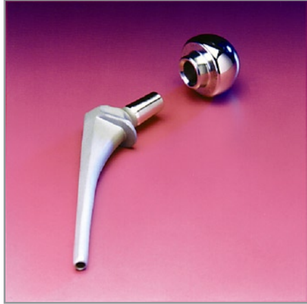
Figure 4 Unipolar Assembly

Once the neck length and head diameter have been determined, the unipolar head can be assembled on the stem ( Figure 4 ). Insertion and final reduction of the hip can now be accomplished.