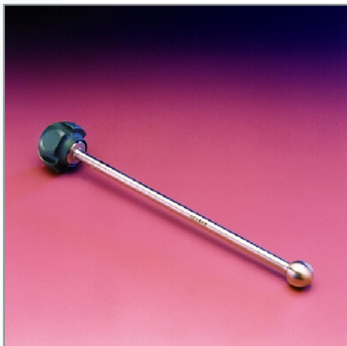
Figure 1 Sizing the Acetabulum