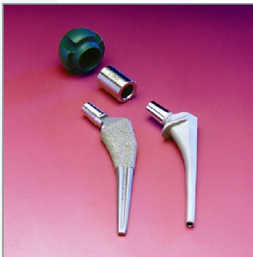
Figure 3 Trial Reduction on Implant